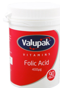
FOLIC ACID 400UG 90`S