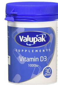
VITAMIN D3 SUPPL 1000IU 30`S