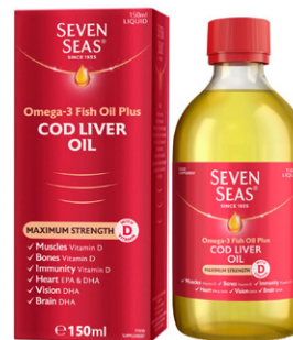
Seven Seas 150ml