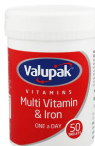
MULTI VITAMIN & IRON OAD 50`S