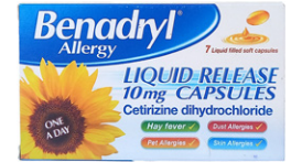
Benadryl Lq Rls 7's