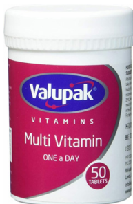
M/VITAMIN OAD 50`S