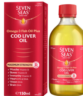
Seven Seas 150ml