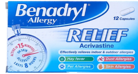
Benadryl Relief 12's