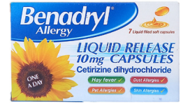
Benadryl Lq Rls 7's